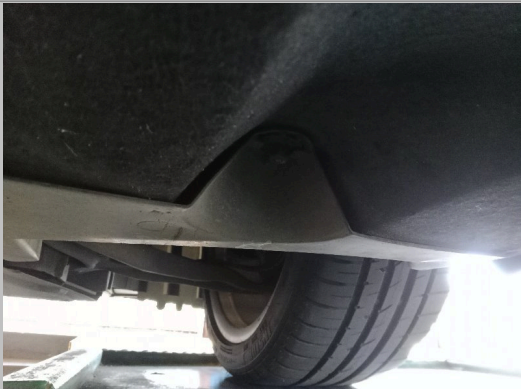
RF TYRE TREAD