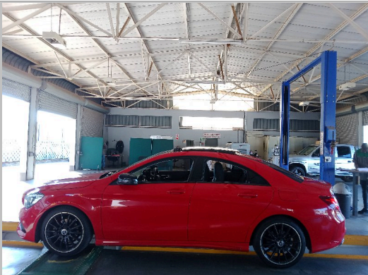
90 DEGREE LEFT