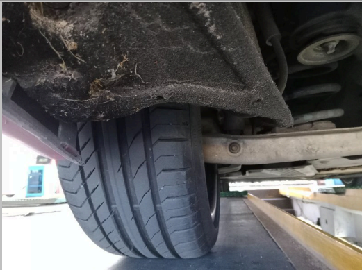
LR TYRE TREAD