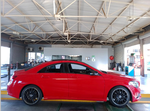
90 DEGREE RIGHT