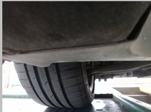
LF TYRE TREAD