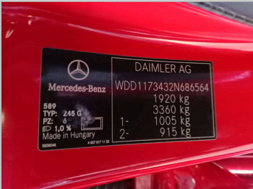
VIN PLATE OR STICKER