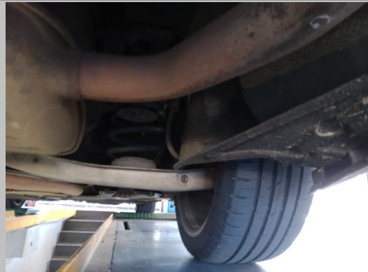
RR TYRE TREAD