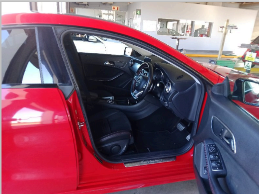
INTERIOR (FRONT DRIVER DOOR)