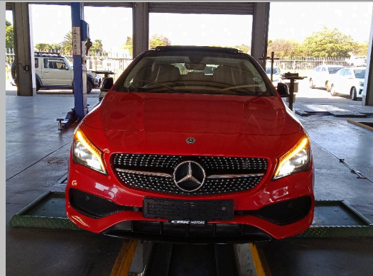
90 DEGREE FRONT