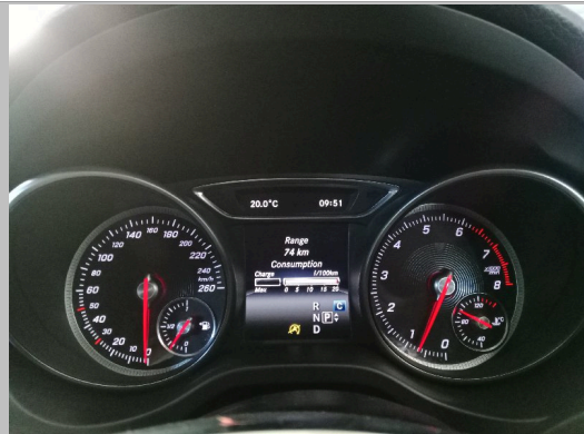
DASHBOARD (W/ ENGINE RUNNING)