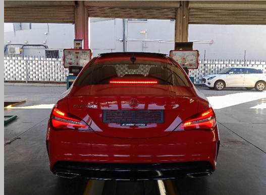
90 DEGREE REAR