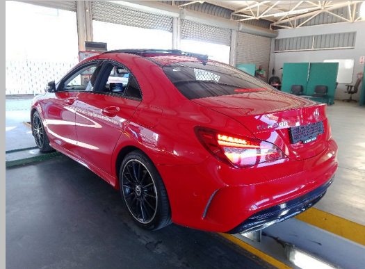
REAR LEFT CORNER